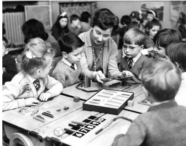
Fig. 3. Pupils are shown how to use the Cuisenaire rods at St Charles' Primary in North Kelvinside, Glasgow, 1965

Psychologically, the value of Cuisenaire's contribution lies in the fact that by providing a semi-abstract material he has overcome the obstacle of the gap between active and intellectual thought. Our minds are swift when dealing with images and representations but they move slowly in the actual performance of an action. (Cuisenaire & Gattegno, 1954, pp. v-vi)